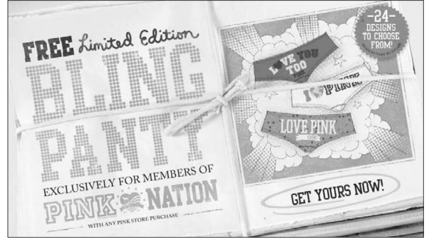
Figure 13-4: The Victoria's Secret Limited Edition Bling Panty giveaway.

number of social media hubs — from Facebook to Twitter to YouTube to Flickr — and leveraging each network to build a groundswell of interested consumers. Figure 13-4 shows you the Victoria's Secret promotion of a Free Limited Edition Bling Panty.