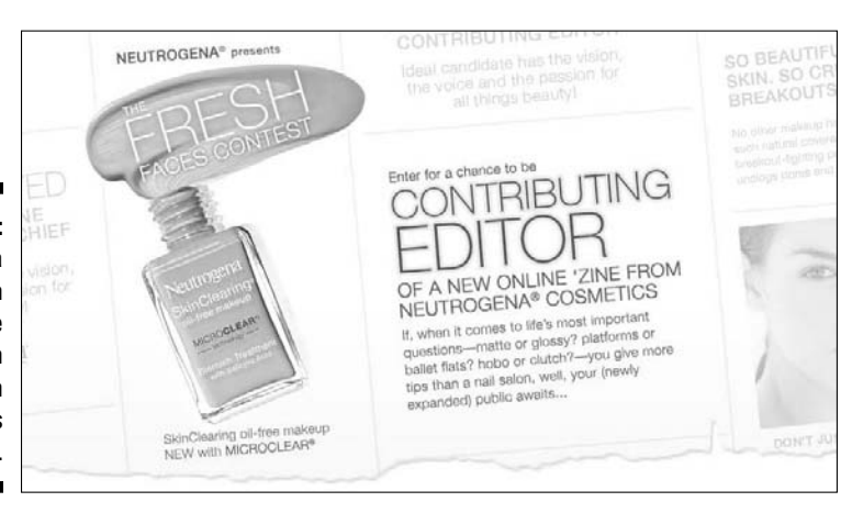
Figure 13-2: Neutrogena teamed with Teen Vogue to launch the Fresh Faces contest.

When Neutrogena launched their Facebook Page in April 2009, they created a contest to build brand awareness and drive the key female, teen audience to their Page. The Fresh Faces contest, which was held in conjunction with Teen Vogue magazine, helped the brand attract more than 700 fans to its Facebook Page (see Figure 13-2). The winner earned a chance to be a contributing beauty editor for a Neutrogena advertorial on TeenVogue.com.