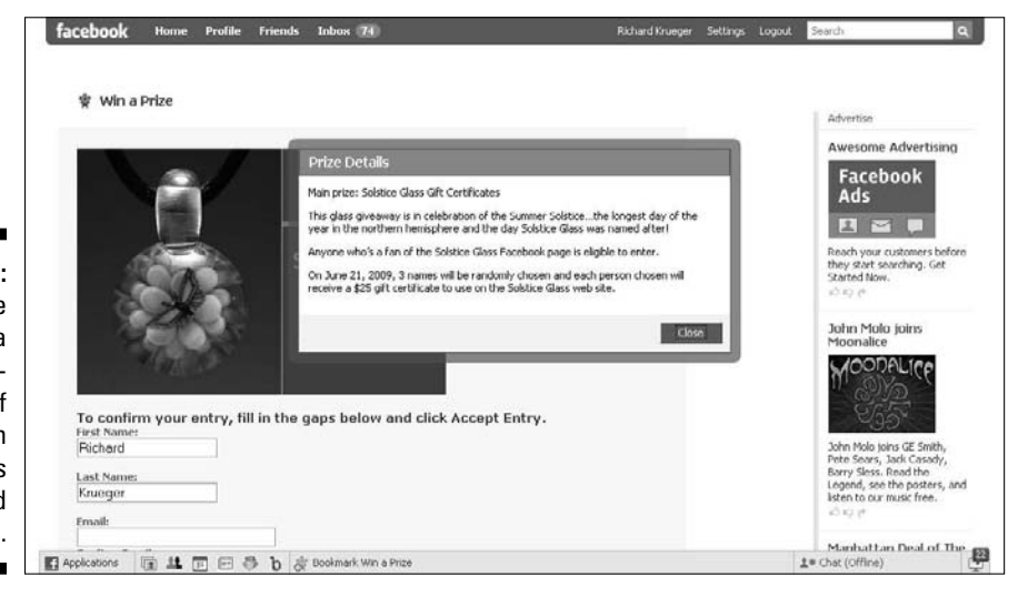
Figure 13-1: Win a Prize offers a build-ityourself approach to contests and giveaways.

Win a Prize by Wildfire Interactive, Inc. is a free Facebook contest app that provides a direct solution for marketers looking to offer a contest or give-away on their Facebook Page. Win a Prize provides everything you need to create and host a contest on your Facebook Page (see Figure 13-1). From your bottom navigation bar, choose Applications: Browse More Applications, and type Win a Prize in the Facebook Search box to find and install the app.